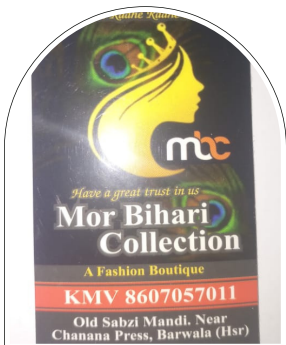
Mor Bihari Collection Founder - Minakshi