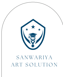
Sanwariya arts solution Founder - Bhavesh